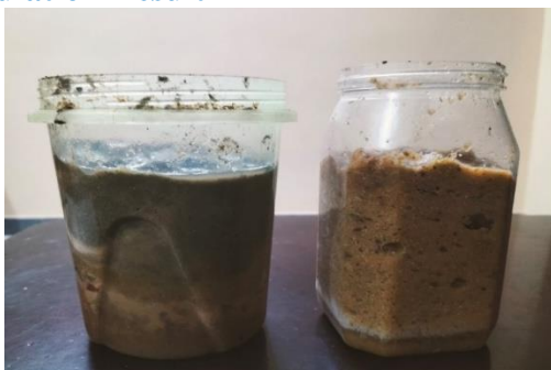
Figure 3 Comparison of Composting

waste decomposition. Bin 1, the control group with only organic vegetable waste, exhibited a slower composting process over the five-day observation period. In contrast, Bin 2, incorporating microorganisms, displayed an impressive 95% effectiveness in accelerating the composting process, surpassing expected outcomes. The heightened efficiency in Bin 2 suggests that microorganisms play a crucial role in expediting the breakdown of organic materials, leading to a more rapid conversion into nutrient-rich compost. The delayed composting in Bin 1 underscores the significance of microorganisms in achieving desired compost maturity levels. This finding implies practical benefits for optimizing composting systems, emphasizing the advantageous role of microorganisms in transforming organic waste into valuable compost for agricultural and environmental purposes. Further investigation is recommended to assess the long-term effects and sustainability of this microorganism-enhanced composting approach. Simulation Readings are shown in Table 1.