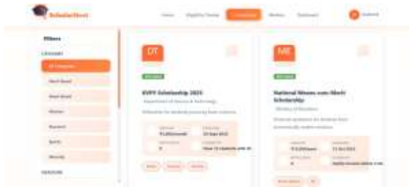
Figure 1 ScholarNest Scholarship Dashboard

available scholarships. The second image shows a hand gesture in front of the screen , representing user interaction with the system.