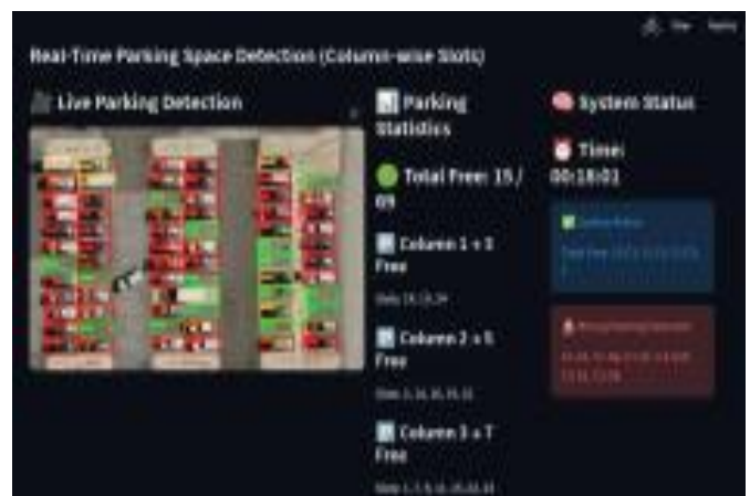
Figure 3 Performance of System

From the above figure, it can be clearly understood that the performance of the system is validated with